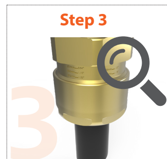
Step 3 The backnut should be level with the marking guide corresponding to its diameter – this can be visually inspected and adjusted as necessary

Note: The cable gland installation instructions have a printed cable OD measure for if the cable OD is not known