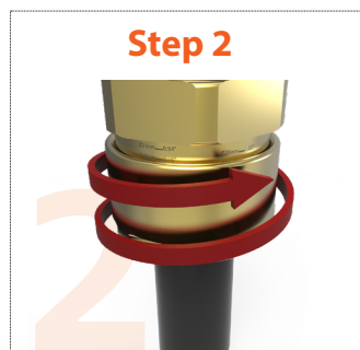
Step 2 Tighten backnut until a seal is formed onto the cable, then tighten one further turn