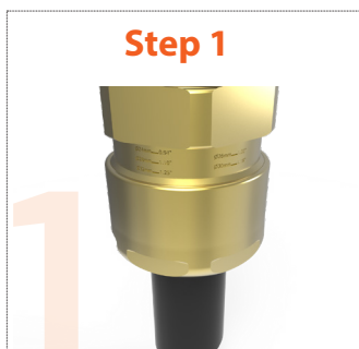
Step 1 Follow cable gland installation instructions until final stage – tightening of rear seal

The gland is permanently marked with various lines/numbers indicating the correct tightening level related to the cable diameter. Following the relevant cable gland Installation Instructions, the back seal should be tightened until a seal is formed on the cable outer sheath and then tightened one further turn.